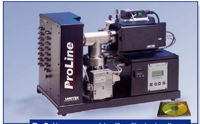
The ProLine comes complete with multiport automatic valve switching, inlet manifold, and turbomolecular pumping package.

Multicomponent analysis. Up to 32 components, 8 or 16 streams.