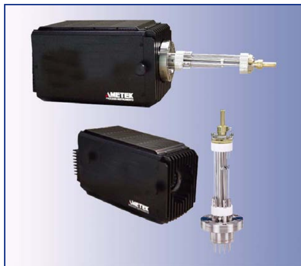
Analyzer head and electronics unit.

One of a family of innovative process analyzer solutions from AMETEK Process Instruments. Specifications subject to change without notice.