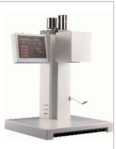
Melt Flow Indexer MFI-10