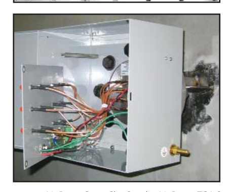
Iris Power Stator Slot Coupler, Iris Power TGA-S and Iris Power TurboGuard are trademarks of Qualitrol-Iris Power.

QUALITROL-IRIS POWER HAS BEEN THE WORLD LEADER IN MOTOR AND GENERATOR WINDING DIAGNOSTICS SINCE 1990, PROVIDING A FULL LINE OF ON-LINE AND OFF-LINE TOOLS, AS WELL AS COMMISSIONING AND CONSULTING SERVICES.